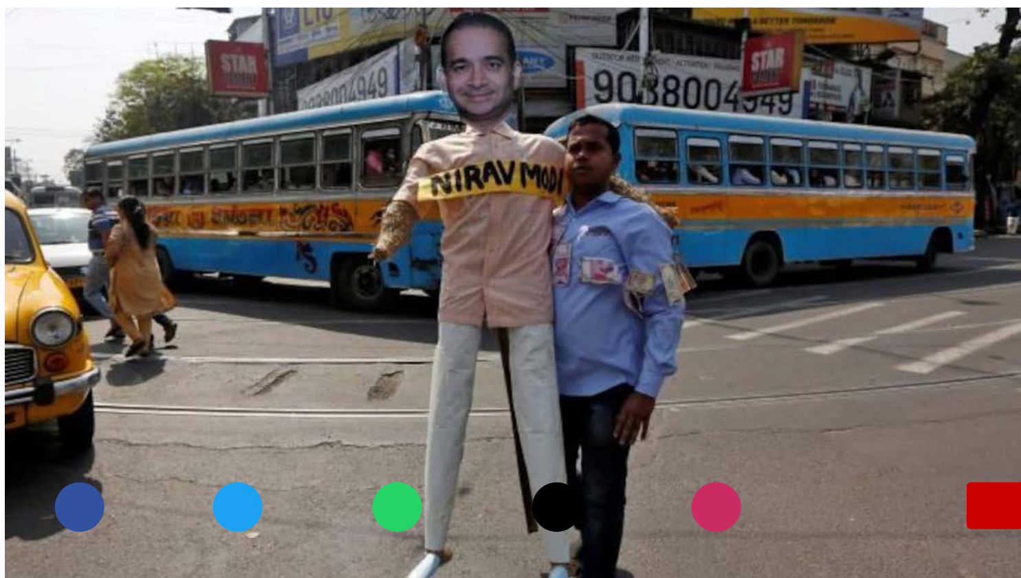
A demonstrator in Kolkata holds an effigy depicting Nirav Modi