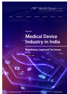
February 2025 Medical Device Industry in India Regulatory, Legal and Tax Issues