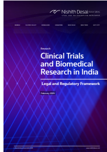
February 2025 Clinical Trials and Biomedical Research in India Legal and Regulatory Framework