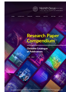
January 2025 Research Paper Compendium Clickable Catalogue of Publications