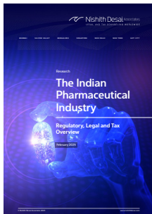
February 2025 The Indian Pharmaceutical Industry Regulatory, Legal and Tax Overview