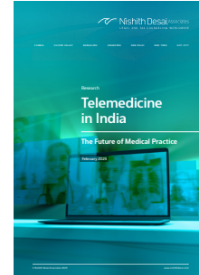
February 2025 Telemedicine in India The Future of Medical Practice