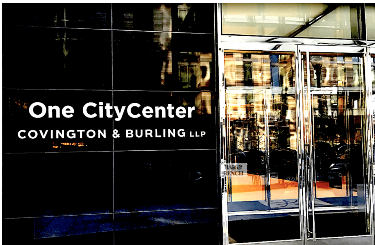
File Photo: Covington & Burling LLP, Washington DC