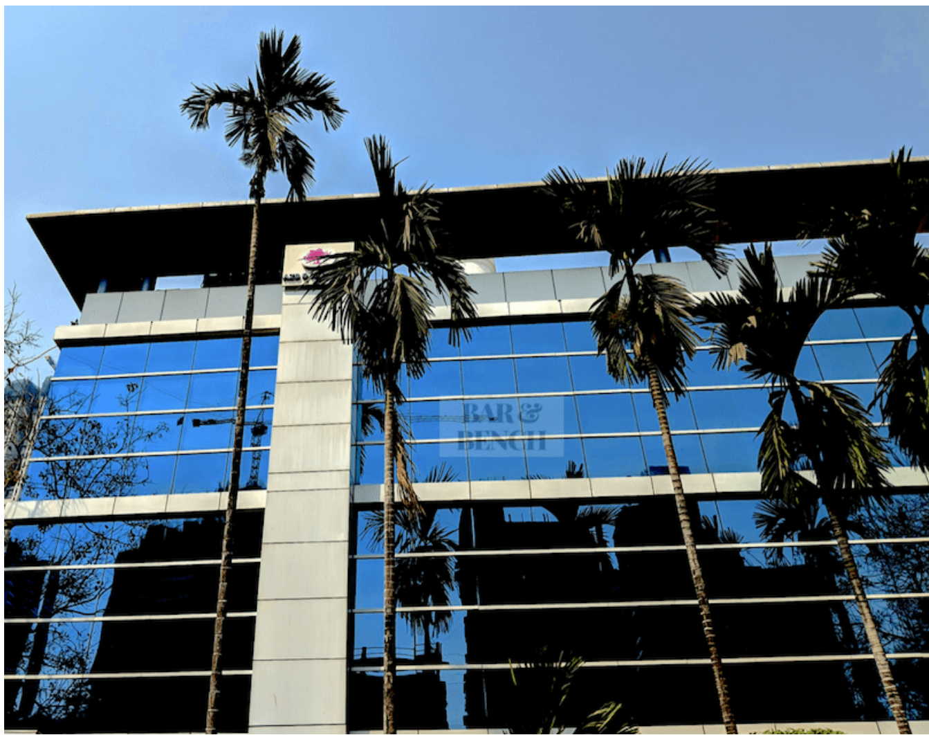
File Photo: AZB & Partners, Mumbai