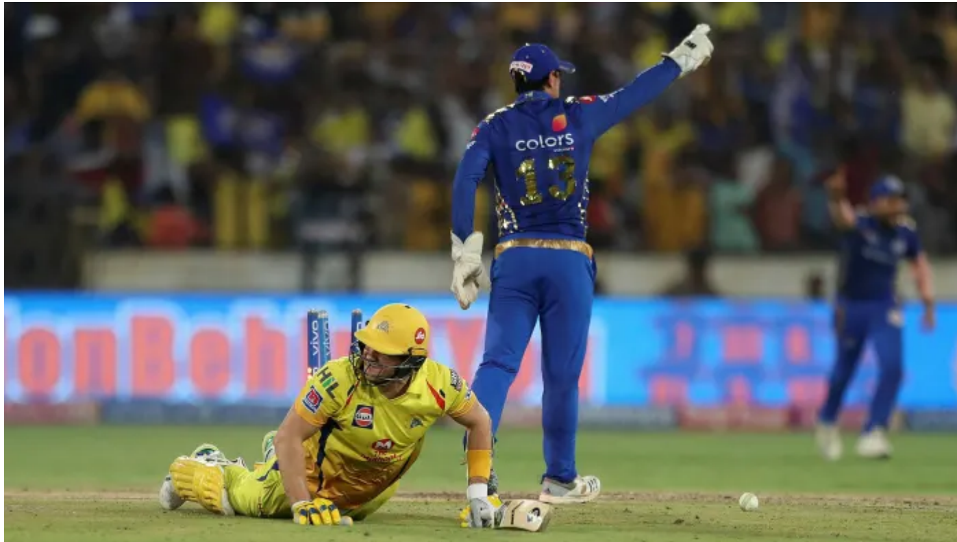
A match between the Mumbai Indians and the Chennai Super Kings last year. The restart of the Indian Premier League is expected to spur gaming activity

Online gaming sector has become investor darling despite strict national rules on sports betting